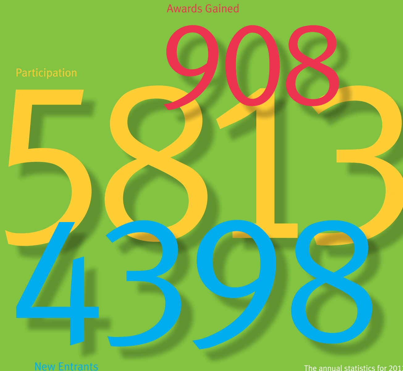
The annual statistics for 2012

The National Youth Center of Korea, an affiliated organisation of the Korea Youth Work Agency, is a comprehensive youth training facility located at Cheonan, South Chungnam Province (90 minutes from Seoul). It includes a variety of facilities where over a thousand people can participate in activities. It includes accommodation, an international exchange centre, camping facilities and an outdoor performing arts centre.